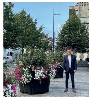
Tom funded funds from where? some of the fantastic flowers and planters for Maidstone.