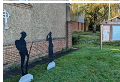
New Allington Remembers Silhouettes at St Nicholas.